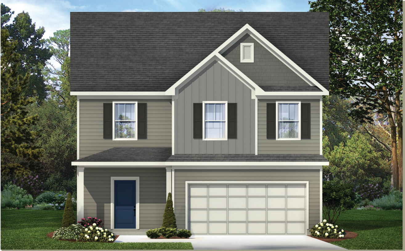
Elevation "B" Featured